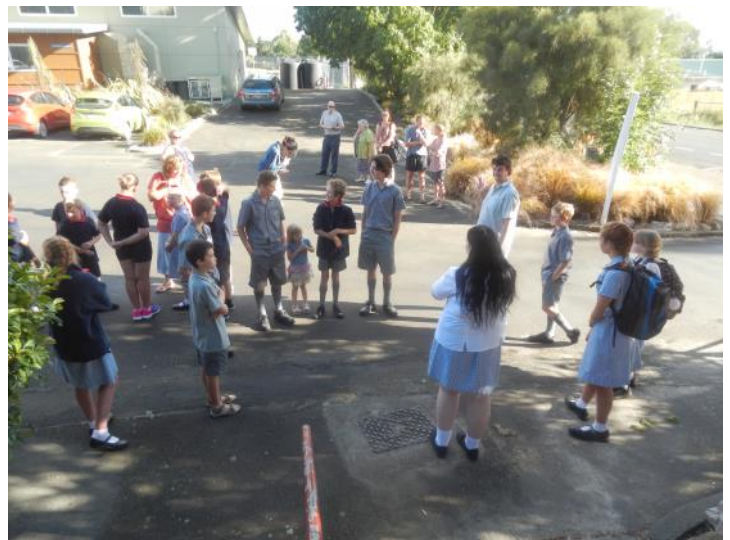
New teachers, students and their families waiting to be welcomed at the powhiri this morning.